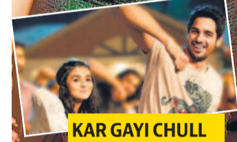
KAR GAYI CHULL