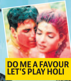
DO ME A FAVOUR LET'S PLAY HOLI